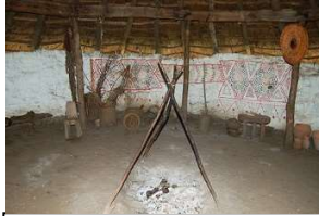
An example of early settler houses in Hemingbrough