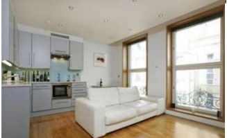
An example of a modern house in Hemingbrough